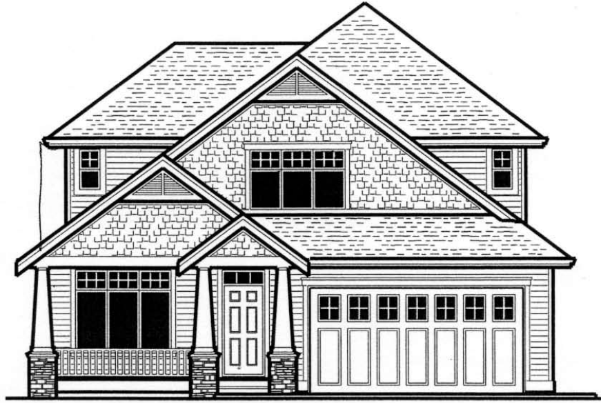
TUNBRIDGE AVE PLAN L-1