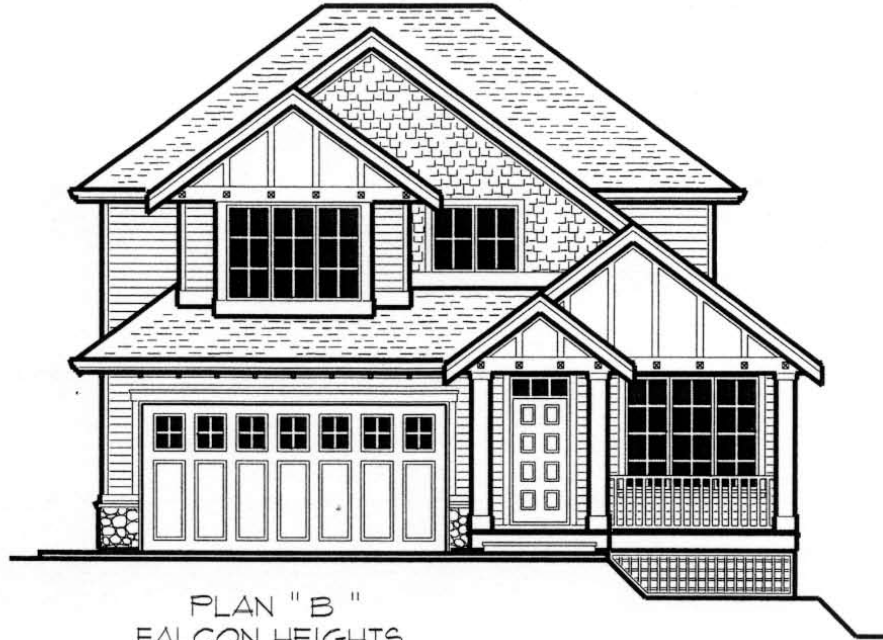
PLAN "B" FALCON HEIGHTS REVISED MAR 17 / 05